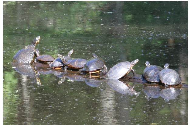
View turtles basking