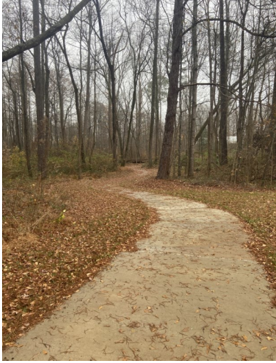
Take a Walk on the Path