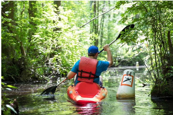
Kayak on the Millpond