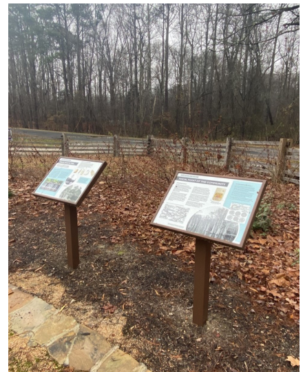
Learn about the Millpond's History