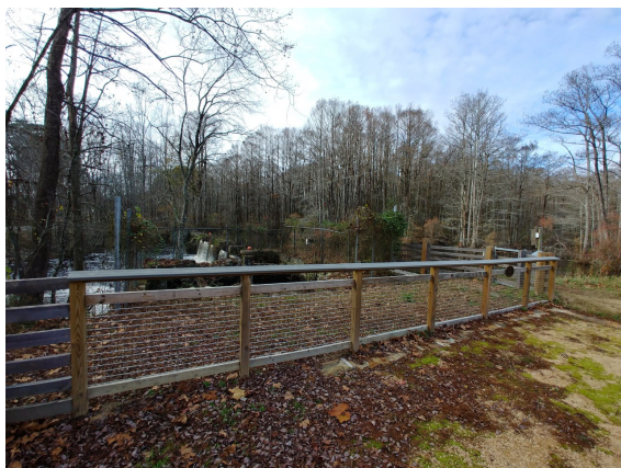
The Old Mill Site