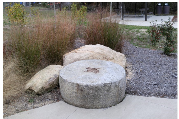
The Mill Stone