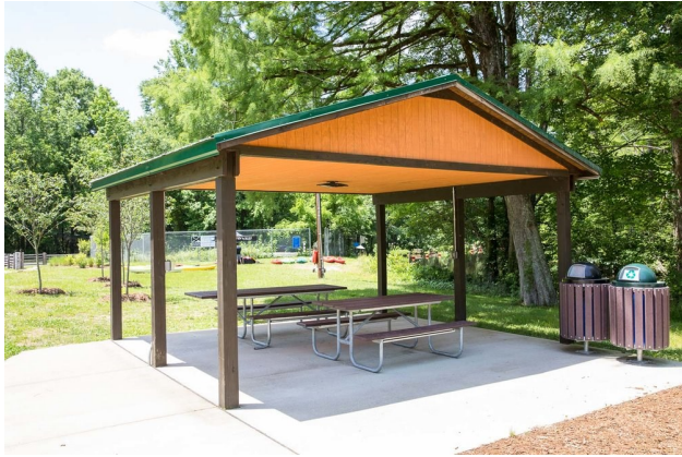
Robertson Millpond Shelter