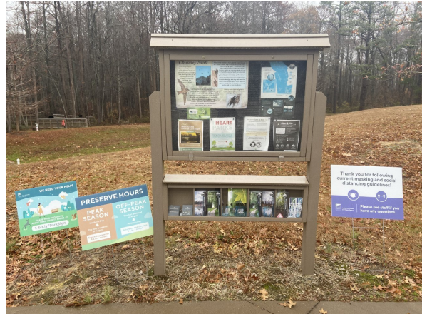
Robertson Millpond Kiosk