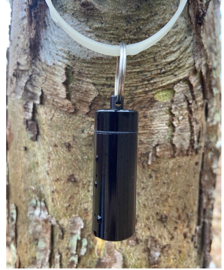
Find the Geocache near the Cabin