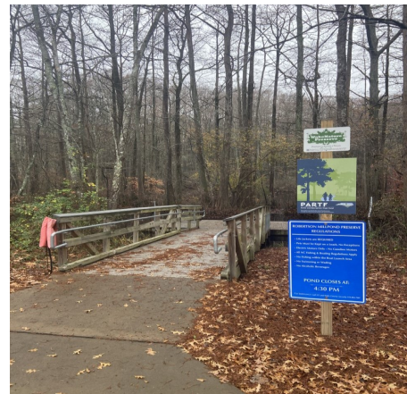
ADA Kayak Launch